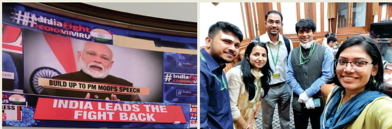
(Deployment of IFS OTs at COVID-19 Control Room, MEA, New Delhi)

Phase-II of ITP commenced on 15 June 2020 through webinar and is in progress.