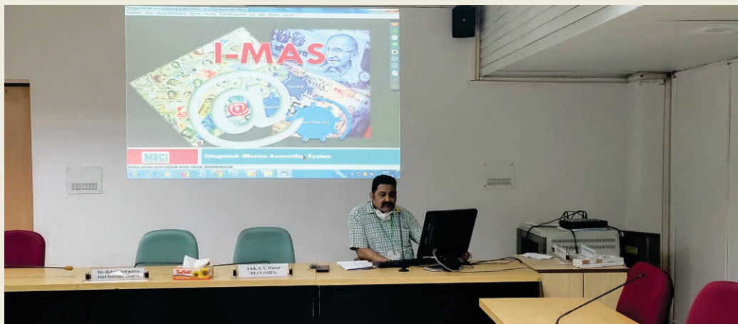
(Speaker addressing on webinar to participants of IMAS Training Programme)

A 1-day IVFRT (consular) training was conducted on 13 June through webinar. The training was attended by 51 participants.