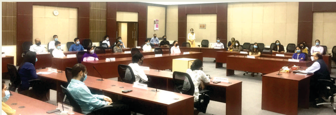
(Address by Dean (SSIFS) to IFS OTs in the Phase-II of ITP)